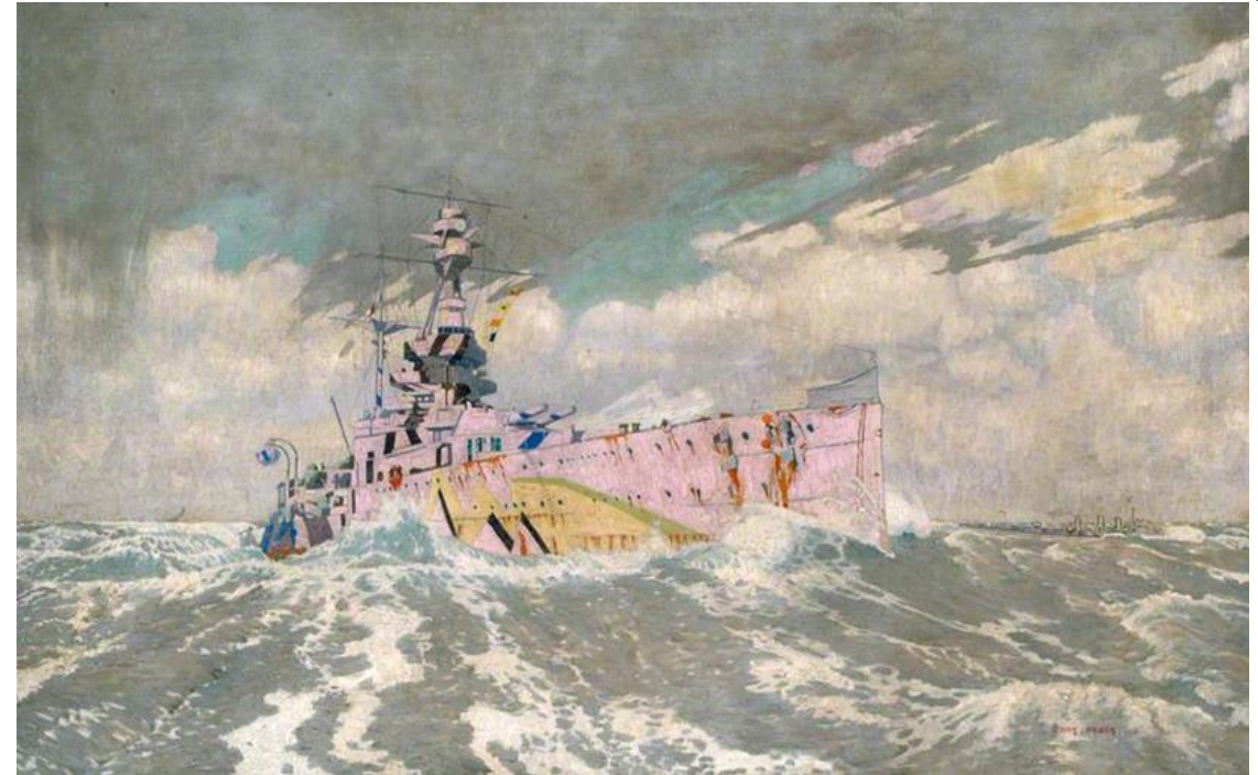
The 5th Ramillies in dazzle camouflage by Charles Pears © the artist's estate.

https://artuk.org/discover/artworks/dazzled-a-camouflaged-battleship-hms-ramillies-in-a-gale-of-wind-6169!